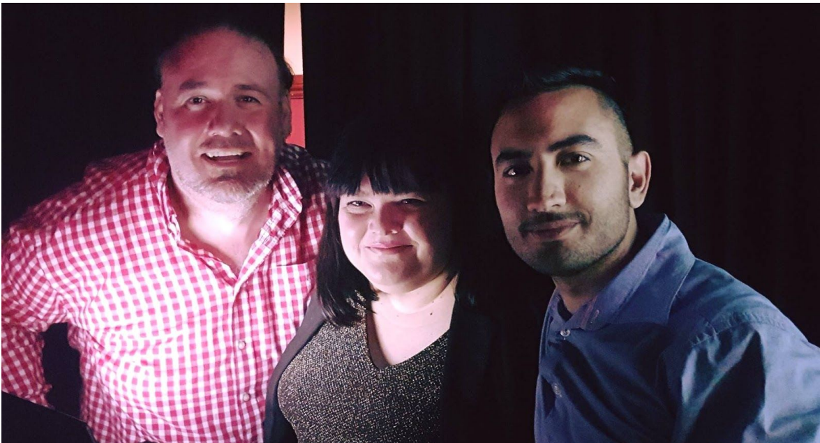
ESCFAN events sub-committee delivering the Sydney Preview Party, April 2017