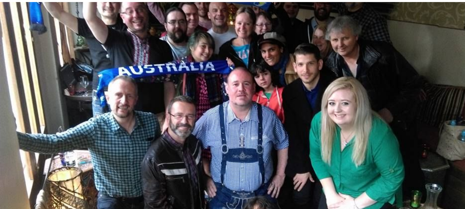
ESCFAN Members Second Chance meet in Melbourne, October 2016

The club exists to meet the needs of a growing ESC fan base within Australia, providing an outlet locally for fans to celebrate the contest on home soil through regular events, a central point for information about Australia's growing role at the contest (such as its broadcast and participation), and a conduit to further the knowledge and promotion of the event within the wider public.