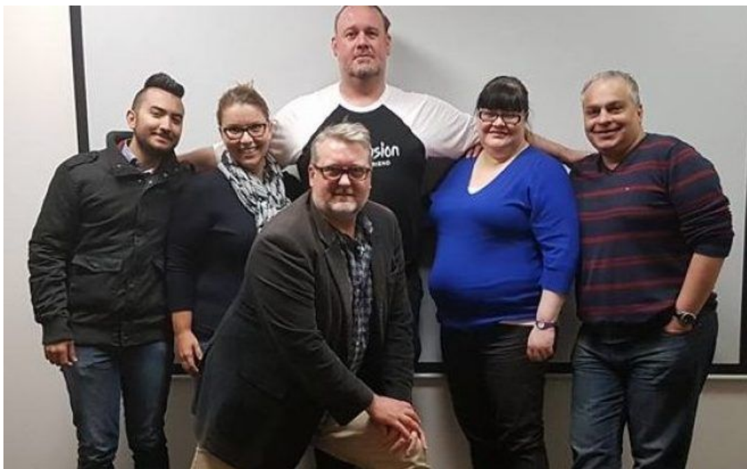
2016-2017 ESCFAN Committee