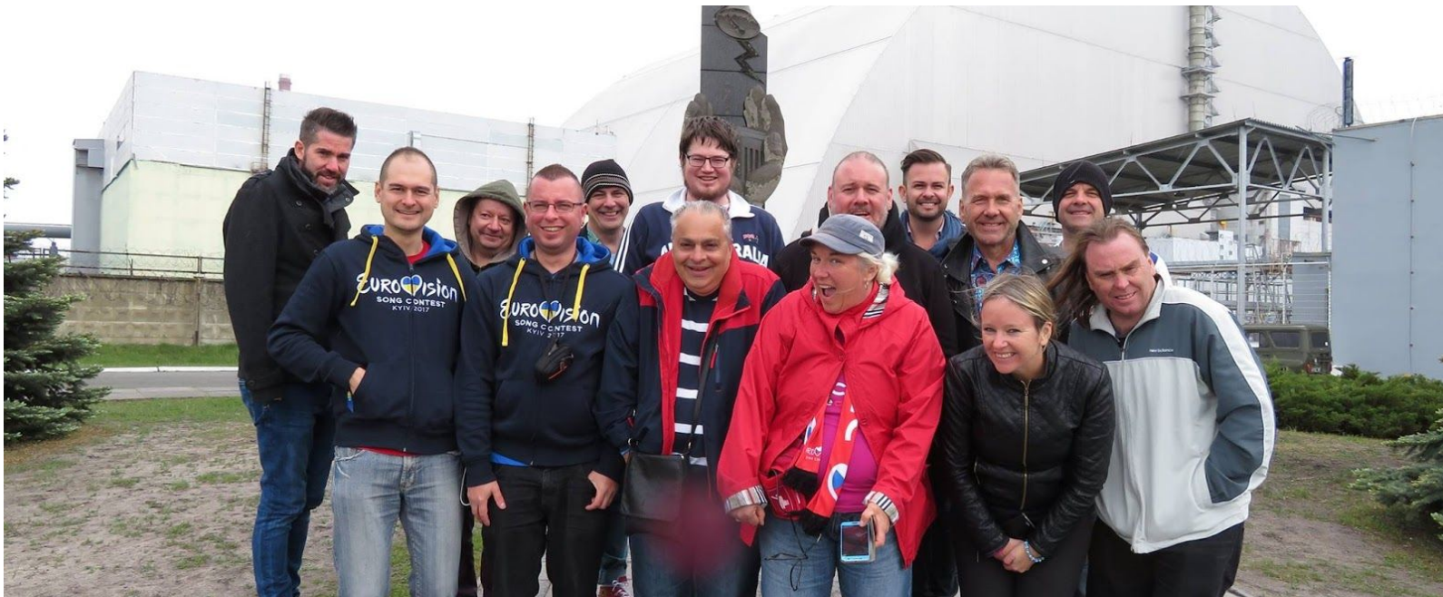
ESCFAN members day out in Chernobyl Ukraine, May 2017

ESCFAN continues to listen to our membership and the wider Australian fan community to ensure that what the club delivers is what our members want. Just as we did at the start of our club, we have undertaken another survey at the start of 2017 to further understand what a local fan club should offer and how it should operate. The results of the survey, as well as ad-hoc emails and messages received from members, continually informs and guides ESCFAN and its deliverables.